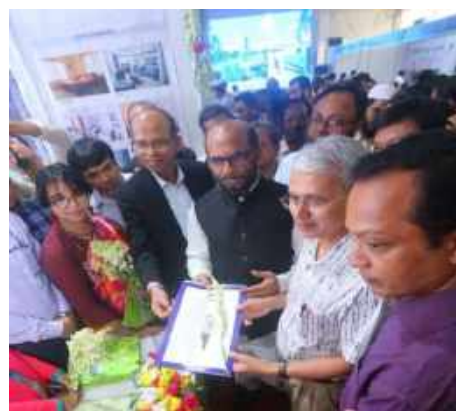
June/ 2019, on the occasion of Rajuk's Service Week, easier transfer of possession of flats in Uttara Apartment Project has been ensured. Allottees accepted the keys of the allotted flats with full satisfaction in the service week from S. M. Rezaul Karim M. P. Minister of the Ministry of Housing and Public Works.