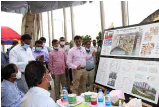
20 th October 2020, Project Inspection by Sharif Ahmed MP, Hon'ble Minister of Housing and Public Works.