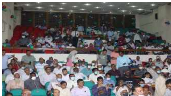
On 22 nd November 2020, IDs of 306 flats in 8 buildings were allotted through digital lottery among 306 allottees of Rajuk Uttara Apartment Project. Minister of Housing and Public Works, Sharif Ahmed MP was the chief guest of the event.