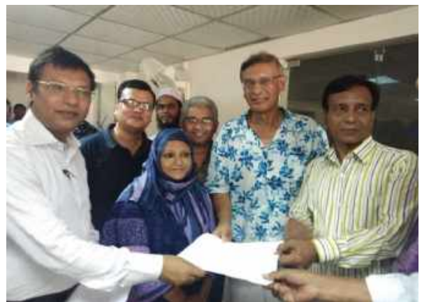
After handover the possession of the flats, RAJUK for the first time formed a building management committee with the participation of all the allottees for the proper maintenance of each building's elevator, generator, surge protection system, fire hydrant system, CCTV and intercom system and safety of the allottees.